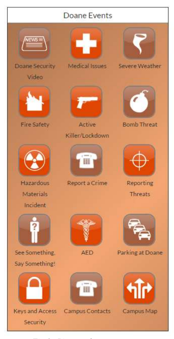
Fig 1. Picture of app screen